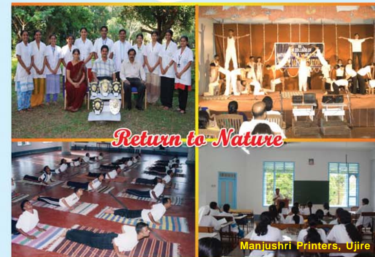
Manjushri Printers, Ujire