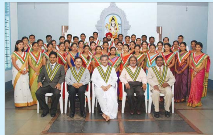
BNYS Graduation Ceremony

RGUHS Website: www.rguhs.ac.in (The form can be downloaded from the University website)